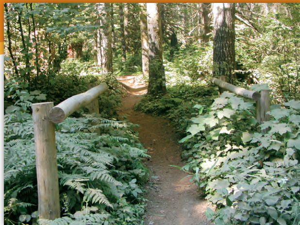
Nels Rogers Trail

Equestrians may access the Historic Hiking Loop from Rogers Camp Trailhead, but most prefer to use Stagecoach Horse Camp. To reach the horse camp follow the directions for University Falls Trailhead. Continue on University Falls Road 1.0 mile to the junction with Rutherford Road and follow the signs.