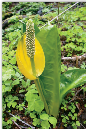
Skunk Cabbage ( Lysichiton americanum )

Another 1.4 miles brings the Wilson River Wagon Road Trail to University Falls Road and Gravelle Brothers Trailhead.