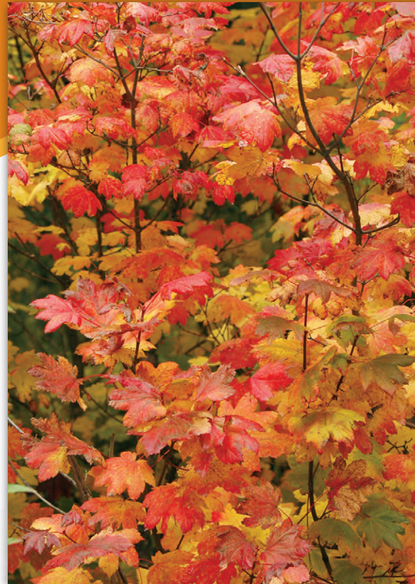
Vine Maple ( Acer circinatum )

This lovely shrub glows during the fall providing splashes of color throughout the forest. It can range from bright yellow, to orange and red as seen here. It is not uncommon to see a leaf that has all of those colors mixed with green. This shrub is a food staple for deer and elk, and Native Americans used its flexible twigs for drum hoops, spoons, and dishes. Now we mostly just enjoy the color and throwing the helicopter-like seeds.