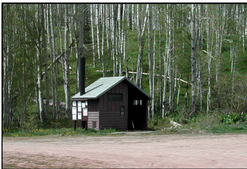
Vaulted Toilet at Horse Ranch Park