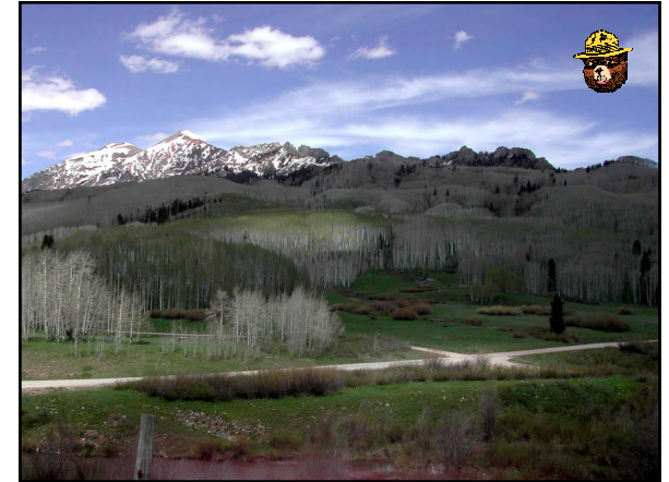
A View of Horse Ranch Park taken from the Cliff Creek FH.