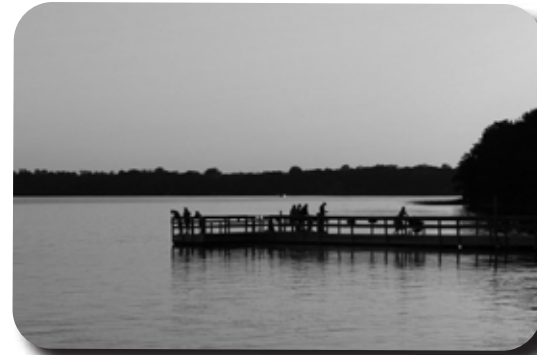
Swim, fish or picnic along Lake Andrew.

Sparked by the support of local citizens, the park has protected the area's rolling glacial hills, beautiful lakes, and diverse wildlife since 1919. Over the years, the park has expanded to include high quality maple-basswood forests, prairies, wetlands and oak savanna. Roads, trails and facilities were developed by a Veteran's Conservation Corps (VCC) crew during the New Deal era. The crew worked here under the direction of the National Park Service from 1935 to 1938. These workers left behind a legacy that you can still experience when you visit the park today. Their project also set the stage for continuing growth and improvement.