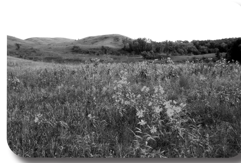
Experience sweeping prairie vistas.

Glacial Lakes State Park was established in 1963 to preserve the area's rolling prairies, high quality habitat, and rich plant life. The park also protects special glacial landforms such as kames (cone-shaped hills), kettles (water-filled depressions), and glacial erratics (large boulders left by the glaciers). Glaciers also left behind glacial till (dirt and gravel) that formed the area's hills and steep rolling terrain. Wildflowers and prairie grasses blanket the landscape from spring through fall. Visit the park and explore all the grasslands have to offer.