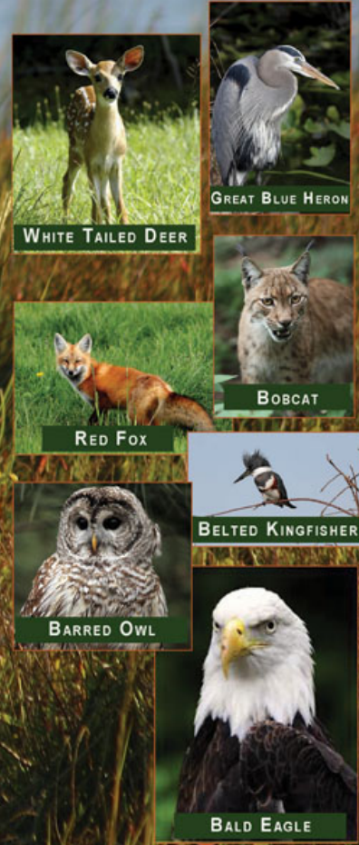
WHITE TAILED DEER

Green Trail: 1.1 mi. This walk takes you through a pristine hardwood swamp past an artesian spring fed pond, home to a bird rookery. Trailhead: N 29°39'25.47" W 081°14'03.75"